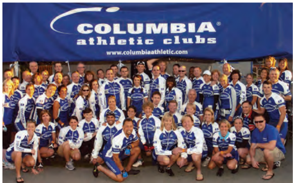
Columbia Athletic Clubs 2009/2010 Bike MS Team